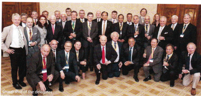
Group shot of the delegates

Prior to the opening ceremony, state of the art live cadaveric dissections were given in head and neck surgery, FESS and mastoid surgery by international authorities in their corresponding fields