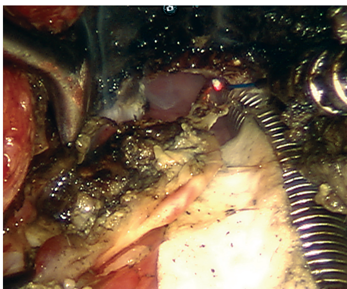
TORS supraglottic laryngectomy